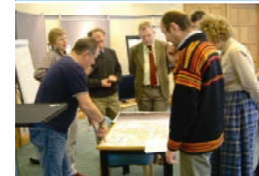
Governance & Policy