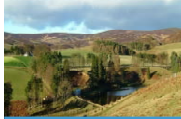
Water Use & Values