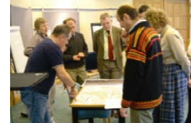
Governance & Policy