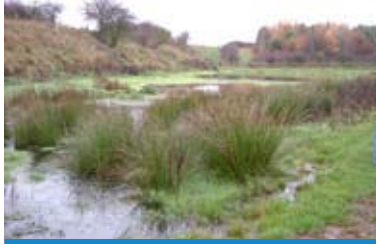
Tackling Diffuse Pollution