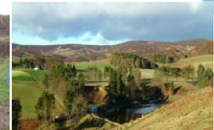
Water Use & Values