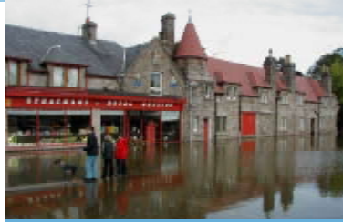
Strategies for the future