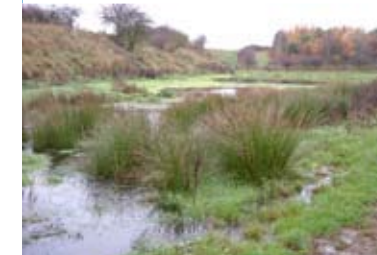
Tackling Diffuse Pollution