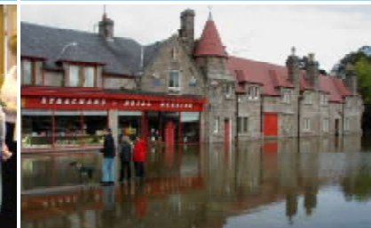
Strategies for the Future